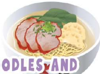
NOODLES AND DUMPLINGS