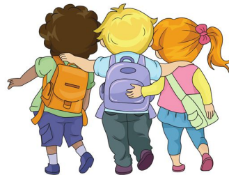
Walk together holding hands