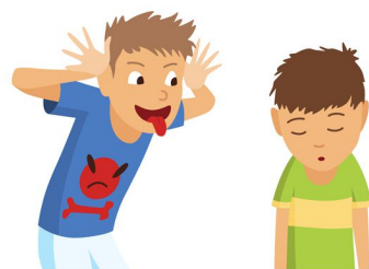
Tell people they can't play