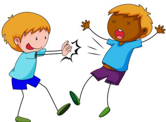
Hurt others (pushing)