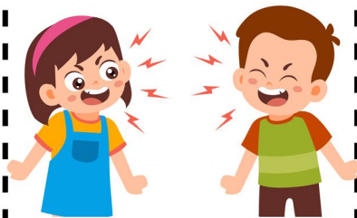
Shout at people